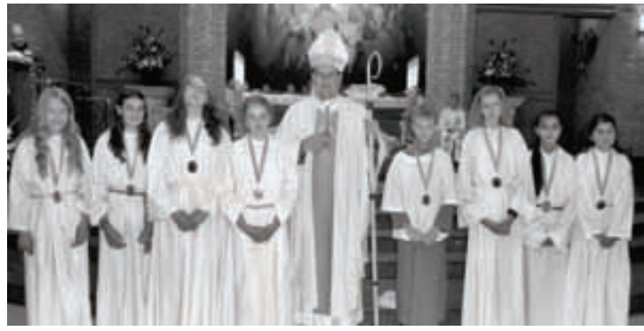
Serra Altar Server Awards

"Hail, Full of Grace! The Lord is with you." Luke 1